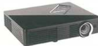
BenQ - PROJECTOR Gp10