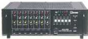
Amplifier - 50 to 700 Watts