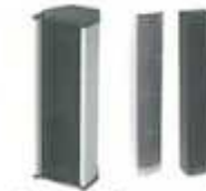
Indoor column speakers