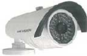
DS-2CE1582P-IRP (Plastic body, IP66)

600 TVL, 1/3" DIS, 20m IR Distance, ICR, 0.1 Lux/F1.2, 12 VDC, Smart IR, Wide operating temperature Range (-40°~60°), IP66, 3.6mm Lens