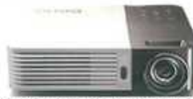
VIEWSONIC PLED-W500 LED Full HD Pocket Projector