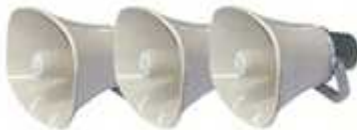
Outdoor horn speakers